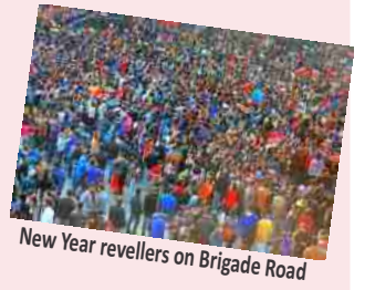
New Year revellers on Brigade Road

ಕಲಿಸಿರಿ, ನೆಲ ಬಗೆದು ಬೆಳೆ ತೆಗೆದವನಾಗುವ ಬದಲು ನೆಲ ಮಾರಿ, ನೆಲ ಕದ್ದು , ಭಾಷಣ ಬಿಗಿದು ಹಣ ಮಾಡಿ ಬದುಕುವೆ ಕಲೆ. ಇದೇ ನಿಮ್ಮ ಹೊಸ ವರ್ಷದ ಹಾರೈಕೆಯಾಗಿದ್ದರೆ ಧನ್ಯ(ವಿ)ವಾದಗಳು