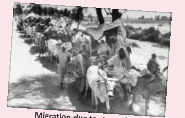
Migration due to starvation