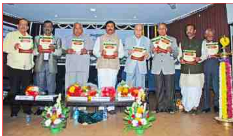
Golden Jubilee Brochure being released

He was speaking after inaugurating the 49 th Foundation Day of IAT and releasing the brochure of Calendar of proposed Activities for Golden Jubilee Celebrations- 2018 at IAT, Bengaluru on 18 th Dec, 2017.